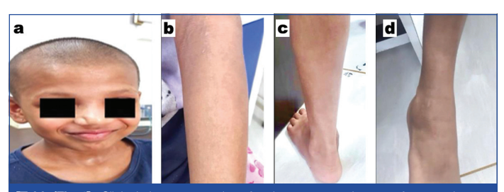
[Table/Fig-4]: Clinical picture presenting after the treatment pictures, after complete resolution of erythematous skin lesion: a) Face; b) Ventral surface of the arm; c) Posterior (Dorsal) surface leg; d) Ventral surface of feet and ankle.

The patient returned after a week with a complete resolution of all symptoms and rashes [Table/Fig-4]. The patient is under regular follow-ups. After one year patient was symptom free without any recurrence. The patient returned to her routine activities after the resolution.